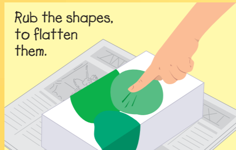
Rub the shapes, to flatten them.

1. Cut lots of shapes from bright colours of paper. Then, brush them with white glue and press them all over a box.