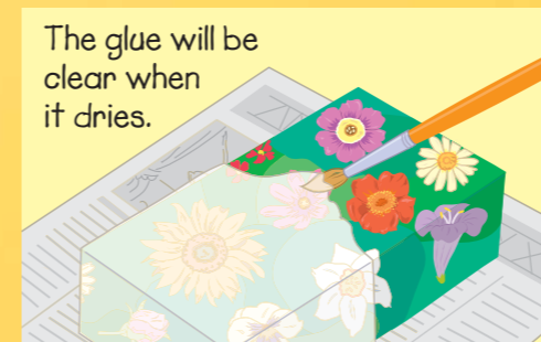
The glue will be clear when it dries.

4. Gently rub the flower, to make it really flat. Then, glue another flower onto the box, a little way from the first one.